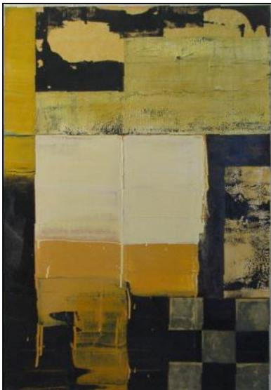
N SOLO XXII